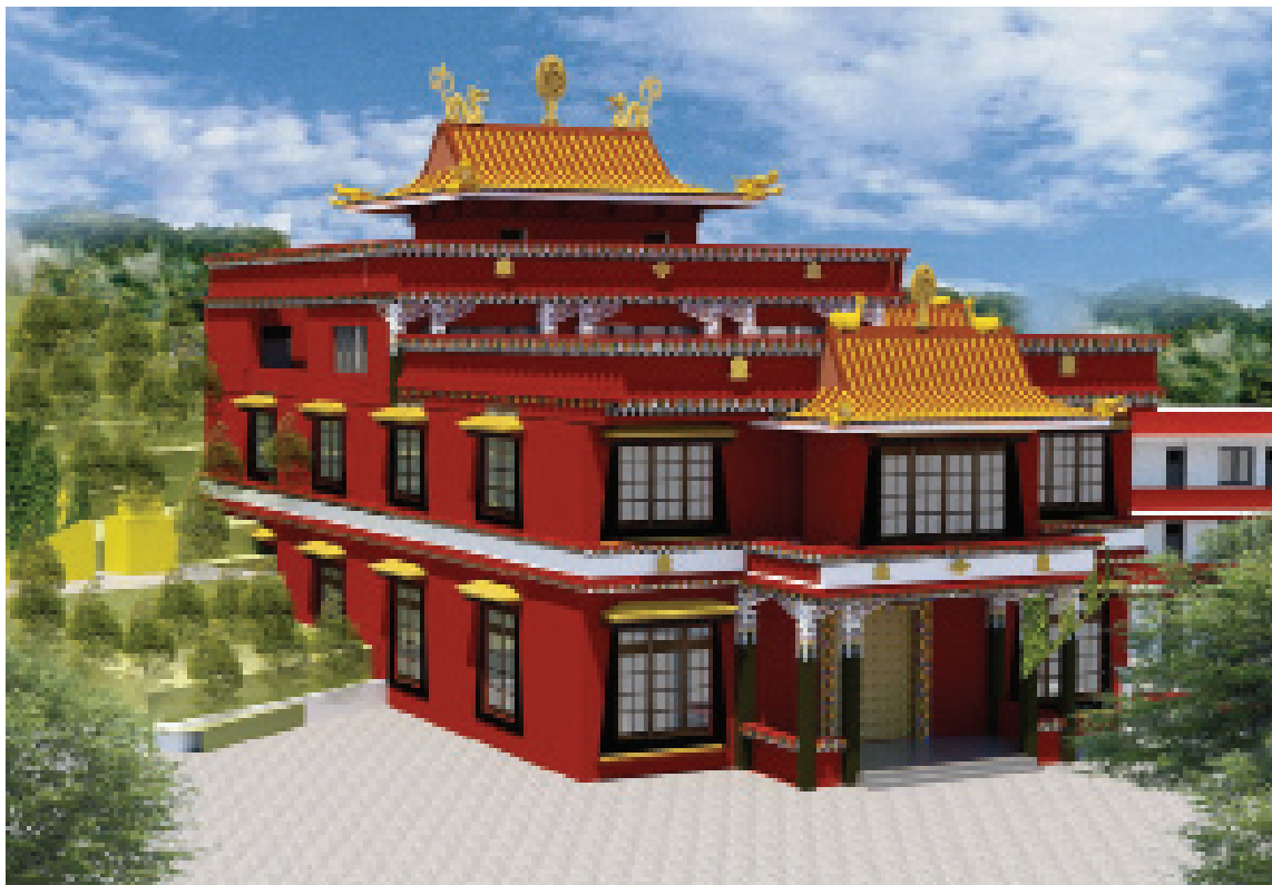
Simulation of the upper part of the new building