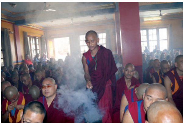
Ceremony in the refectory due to lack of space